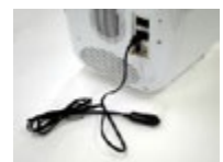
> Car Jack