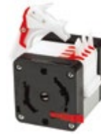
Microcassette Pump Head