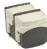
Stacking Pump Head with Standard Pump Head