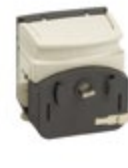
Stacking Pump Head